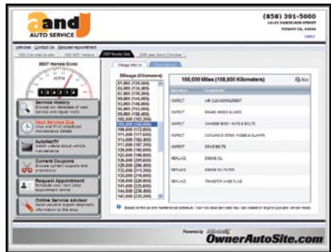
The Next Service Due feature provides important details for scheduled maintenance.