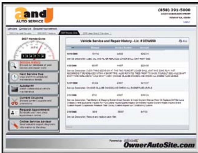
Vehicle Service History is available in a convenient window for printing and sorting.